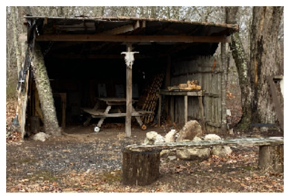
The Camp at the Parade Grounds beckons to our blackpowder fans—with tasty and filling treats for a woodsy gathering.

To enter the actionpacked, sooty world of muzzleloading (and learn a lot about our ancestors' accuracy and techniques) contact us any time. Come see our upcoming trailwalks and line shoots!